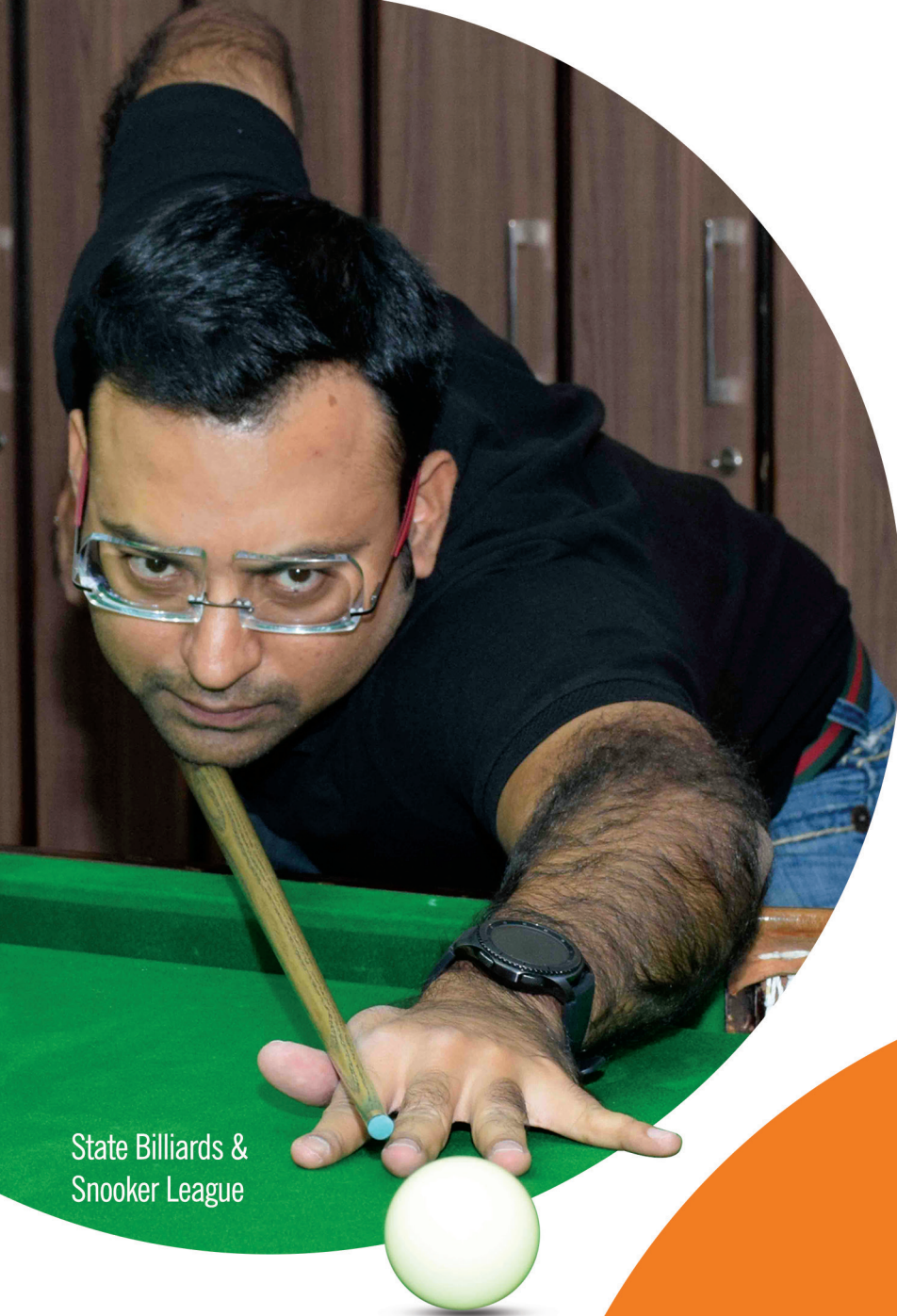
State Billiards & Snooker League