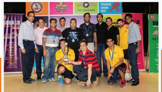
Squash Premiere league