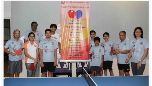
Table Tennis League