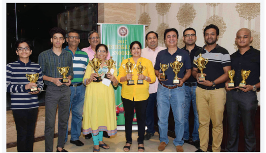
State Billiards & Snooker League