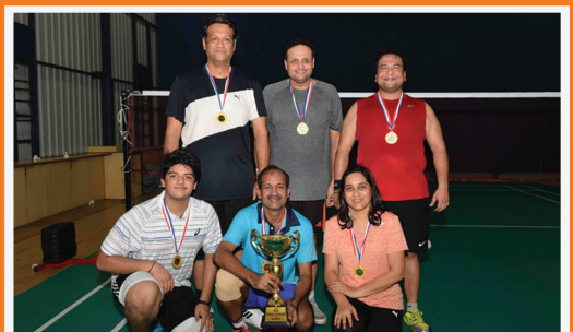
Badminton Rounders Cup