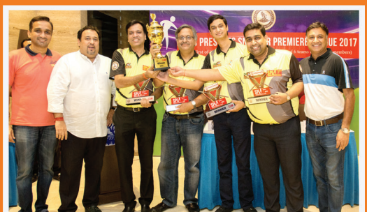
BRC Snooker League