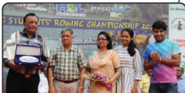
Chairman, Rowing Committee is being felicitated for his Life Time Achievement in Rowing