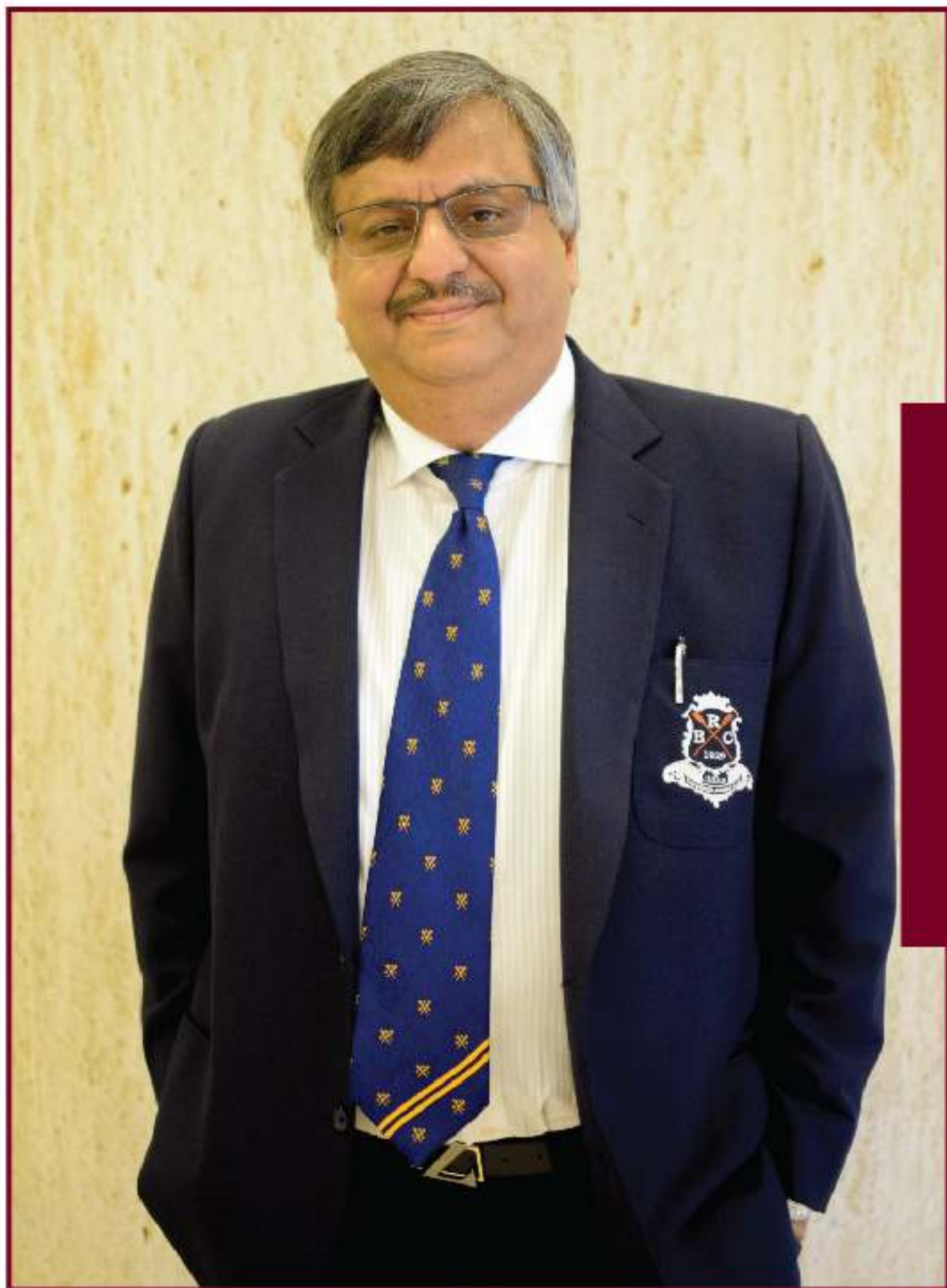
BRC | PRESIDENT